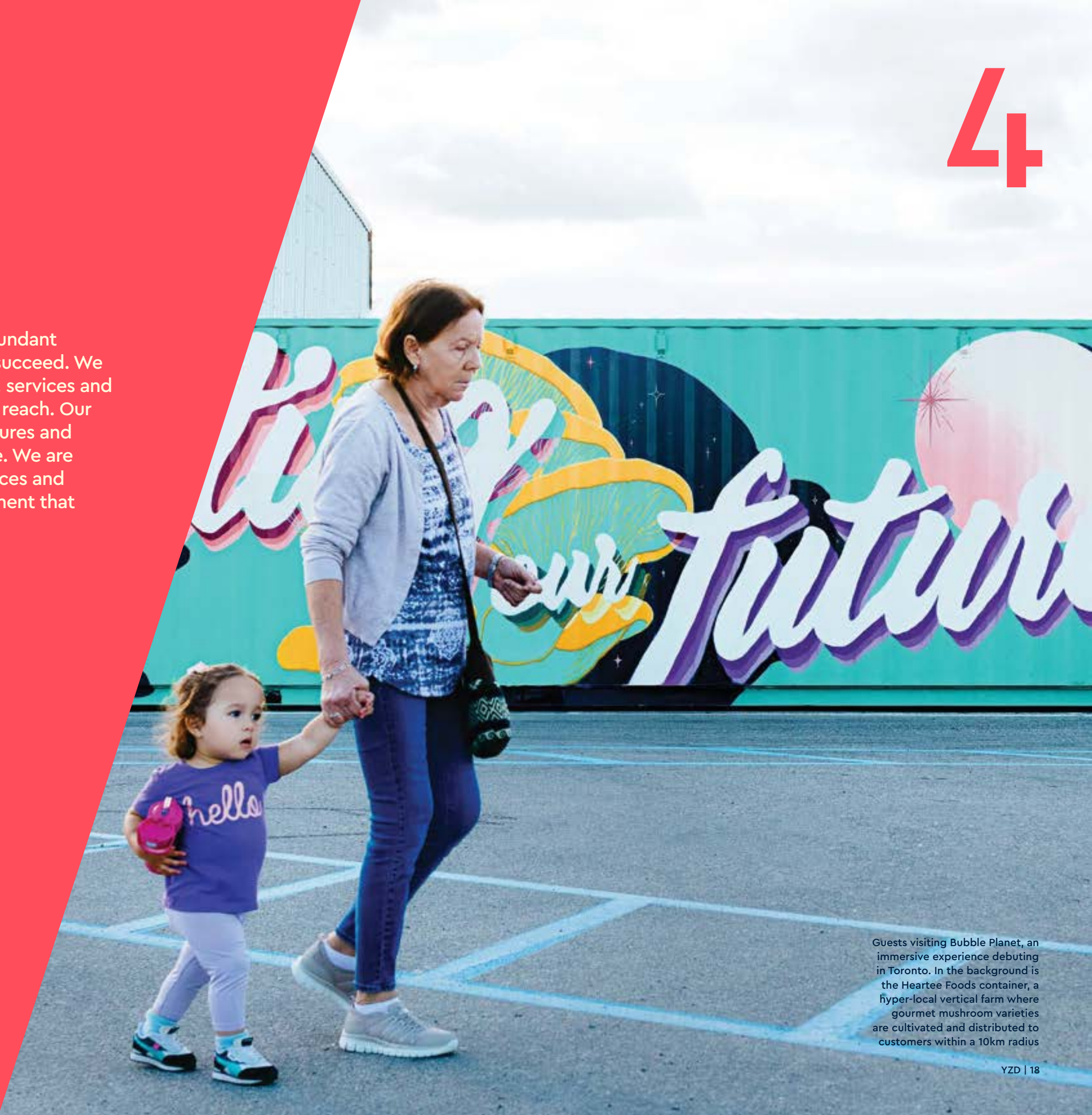
Guests visiting Bubble Planet, an immersive experience debuting in Toronto. In the background is the Heartee Foods container, a hyper-local vertical farm where gourmet mushroom varieties are cultivated and distributed to customers within a 10km radius