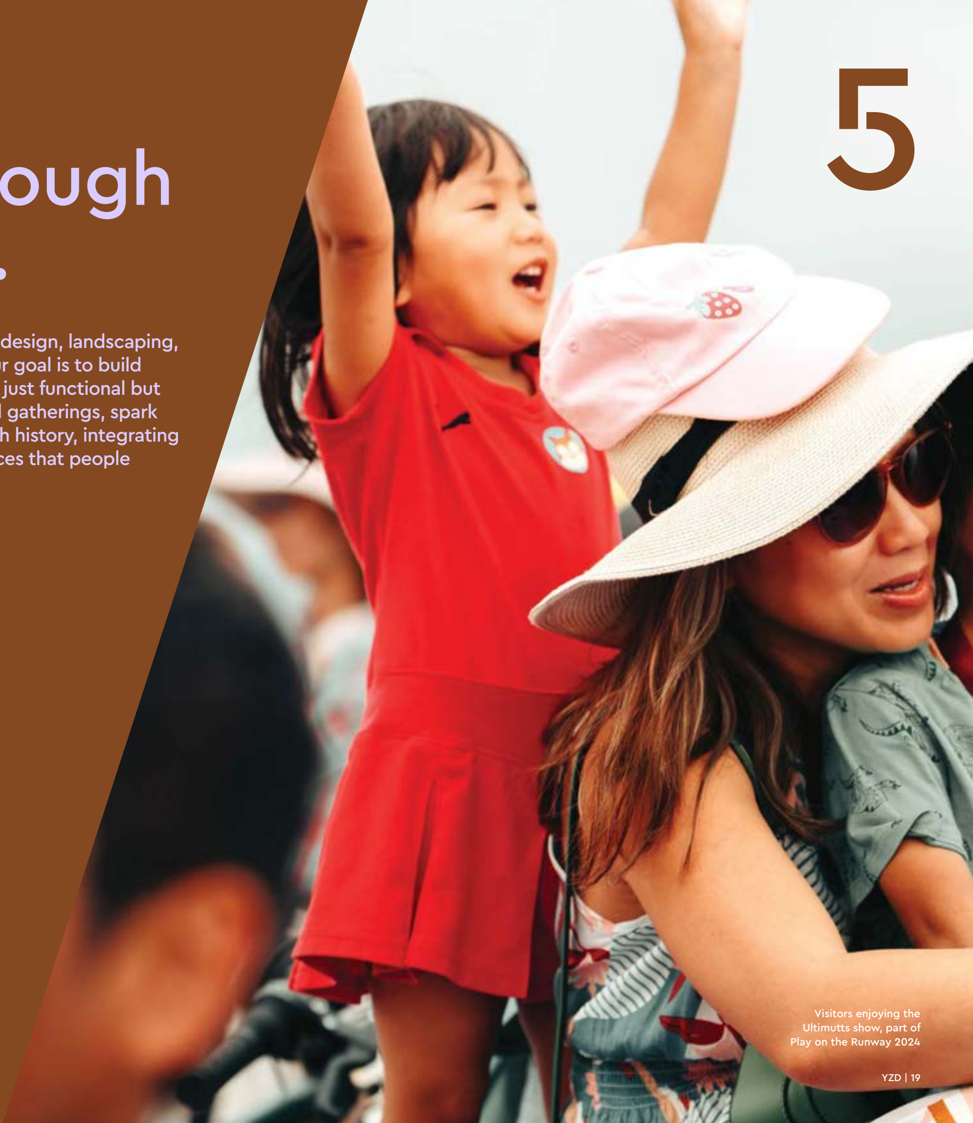
Visitors enjoying the Ultimutts show, part of Play on the Runway 2024