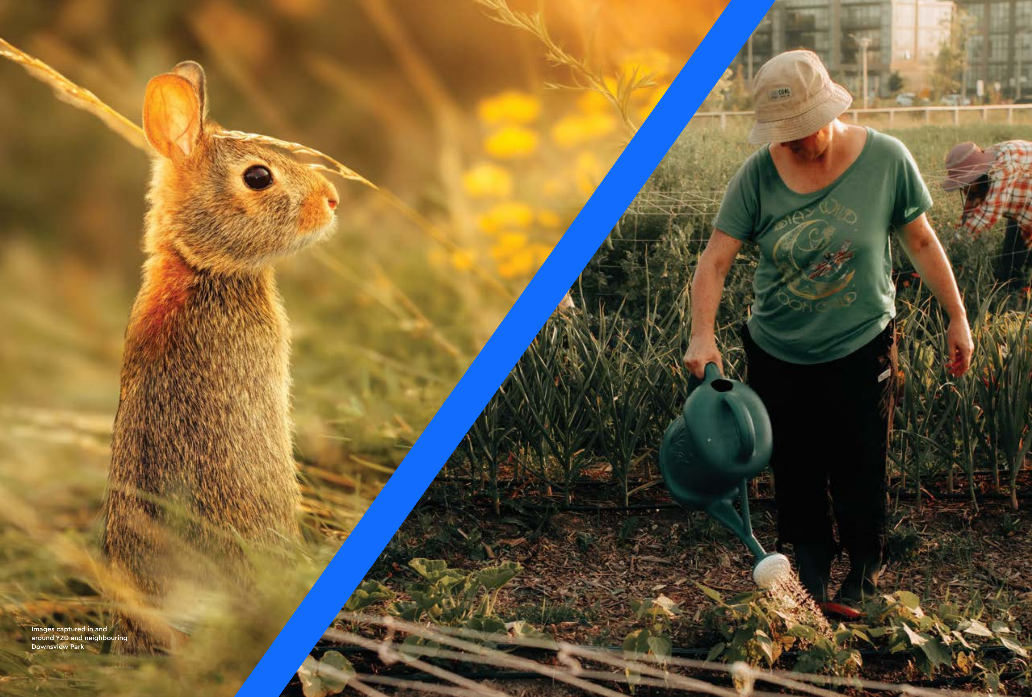
Images captured in and around YZD and neighbouring Downsview Park